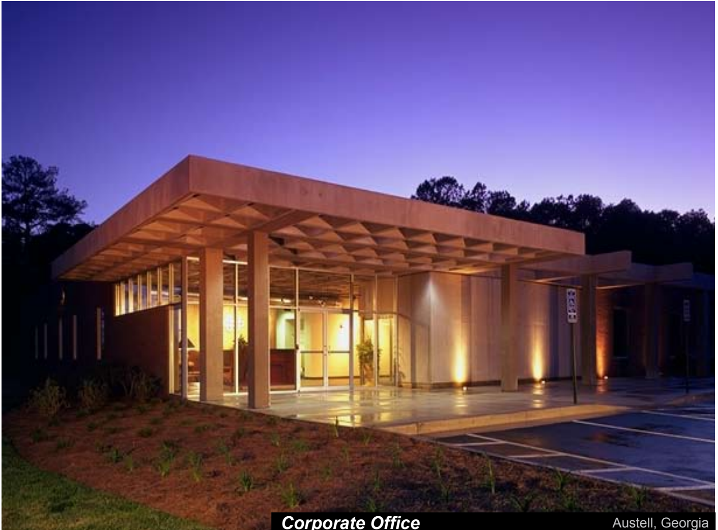
Corporate Office United Forming, Inc.